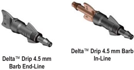
Delta™ Drip 4.5 mm Barb End-Line