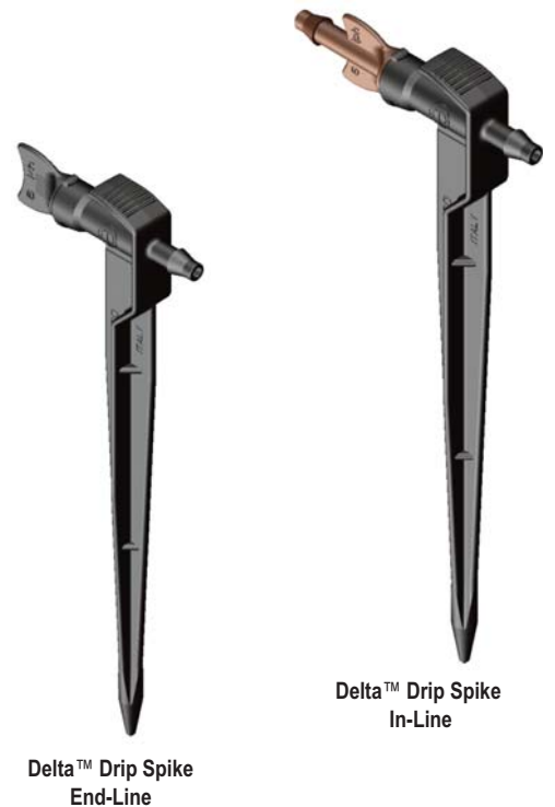
Delta™ Drip Spike End-Line